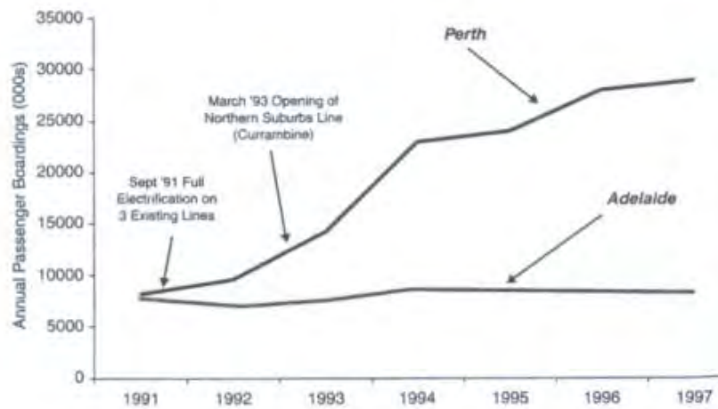
Figure 1 Growth in Perth versus Adelaide Rail Patronage

The apparent success story of the Fremantle line opened the debate on the northern suburbs rail option in 1988. Eventually, the State government allocated AU$ 220 million in 1989 for the construction of northern suburban lines. The work was awarded to Asea Brown Boveri with Westrail, and began in 1990, opening in late 1992. Consequently, the patronage on the Perth rail system went from 7 million passengers a year to almost 30 million from 1992 to 1997 as show in Figure 1 (Newman, undated).